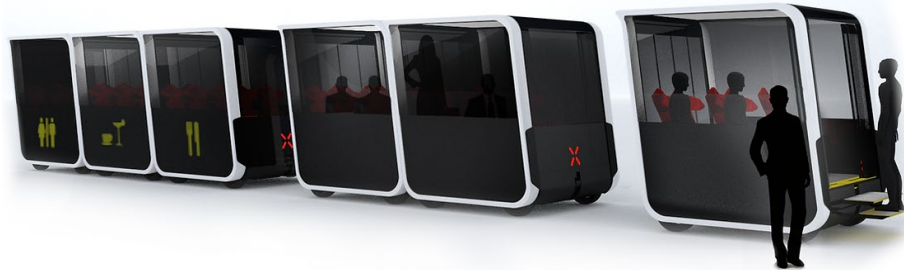
Figure 2: Next pods (cf. https://www.next-future-mobility.com/ )

Khan, Z. ; Weili, H.; Menendez, M. (2022) discuss the application of modular vehicle technology to mitigate bus bunching and take NEXT Future Transportation Pods as examples for autonomous modular vehicles (AMVs). The pods “are capable of in-motion transfer, which allows the modular units to couple and decouple while moving on roads, so that passengers can transfer from one unit to another while traveling”. The pods can also be used for cargo transport.